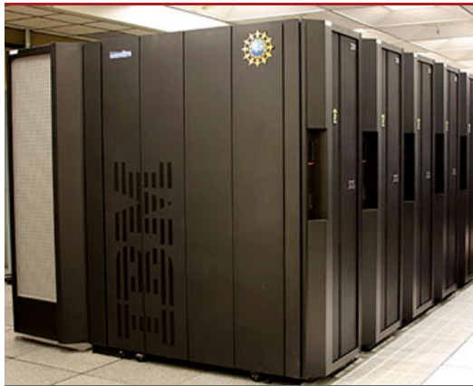
Bluefire. [ENLARGE] News media terms of use*

BOULDER—The National Center for Atmospheric Research (NCAR) has taken delivery of a new IBM supercomputer that will advance research into severe weather and the future of Earth's climate. The supercomputer, known as a Power 575 Hydro- Cluster, is the first in a highly energy-efficient class of machines to be shipped anywhere in the world.