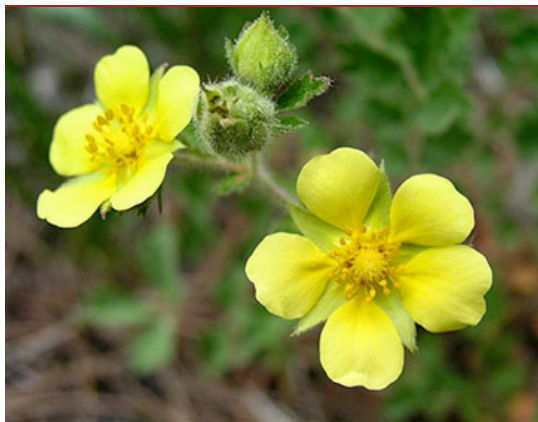
Cinquefoil wildflowers in Colorado. [ENLARGE] News media terms of use*

BOULDER—A nationwide initiative starting tomorrow will enable volunteers to track climate change by observing the timing of flowers and foliage. Project BudBurst, operated by the University Corporation for Atmospheric Research (UCAR) and a team of partners, allows students, gardeners, and other citizen scientists in every state to enter their observations into an online database that will give researchers a detailed picture of our warming climate.