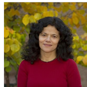
Climate change poses major risks for unprepared cities |... www2.ucar.edu