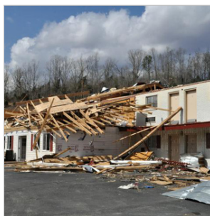
Twisters and teleconnections | UCAR - University www2.ucar.edu