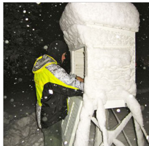
Snowfall measurement: a flaky history | UCAR www2.ucar.edu