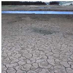
Extreme weather in a changing climate: Asking the right www2.ucar.edu