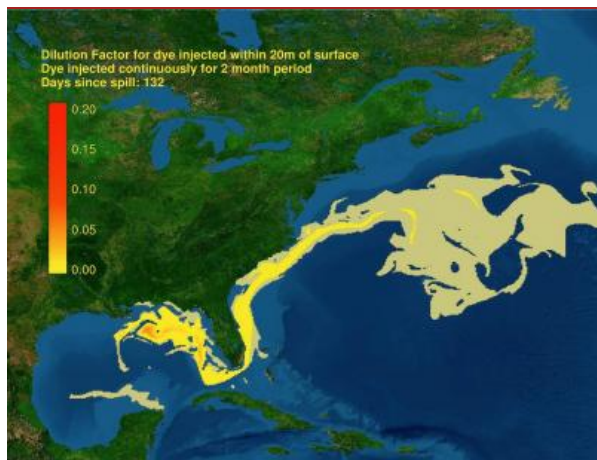
A still from the animation showing the oil trajectory after 130 days.

The scenarios all differ in their starting conditions, a technique used in weather and climate forecasting to determine how uncertainty about current conditions might affect predictions of the future.