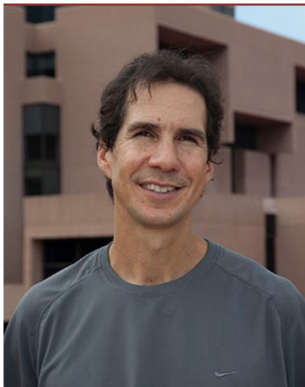
John Fasullo (©UCAR)

Now that the atmospheric patterns have snapped back and more rain is falling over tropical oceans, the seas are rising again. In fact, with Australia in a major drought, they are rising faster than before.