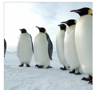
Emperor penguins threatened by Antarctic sea ice loss www2.ucar.edu