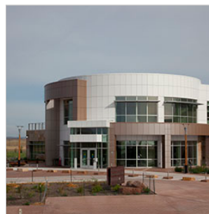
NWSC named "Green" Data Center of the Year | UCAR – www2.ucar.edu