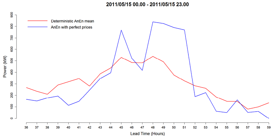
Figure 2. Hourly time-series as a function of forecast lead time of the deterministic forecast provided by AnEn mean (red), and optimal quantile forecast (blue) chosen, in the case of perfect prices forecast, by using the PDF of AnEn in the Eq. (4).

red line). The uncertainty of price forecasting significantly reduces this increment even if a greater annual income, compared to the deterministic approach, is still achieved.